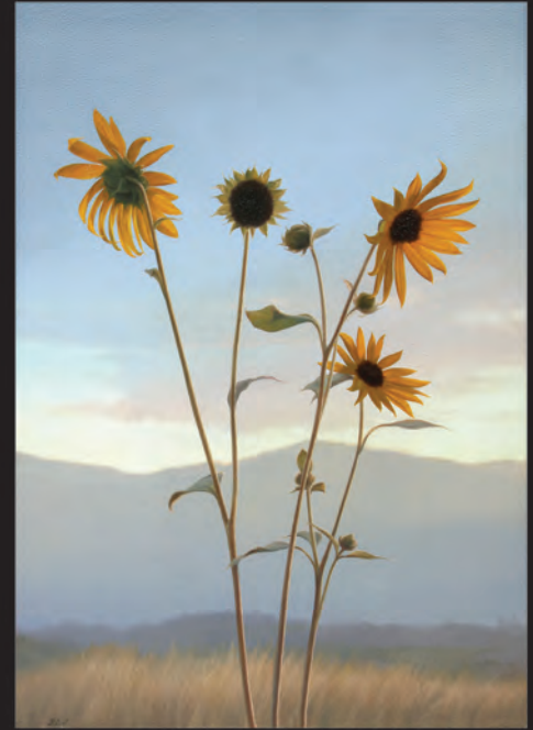
BRETT SCHEIFFLEE (b. 1986) August Sunflowers , 2017 Oil on panel, 12 x 8 1/2 in. Ann Korologos Gallery, Basalt, CO