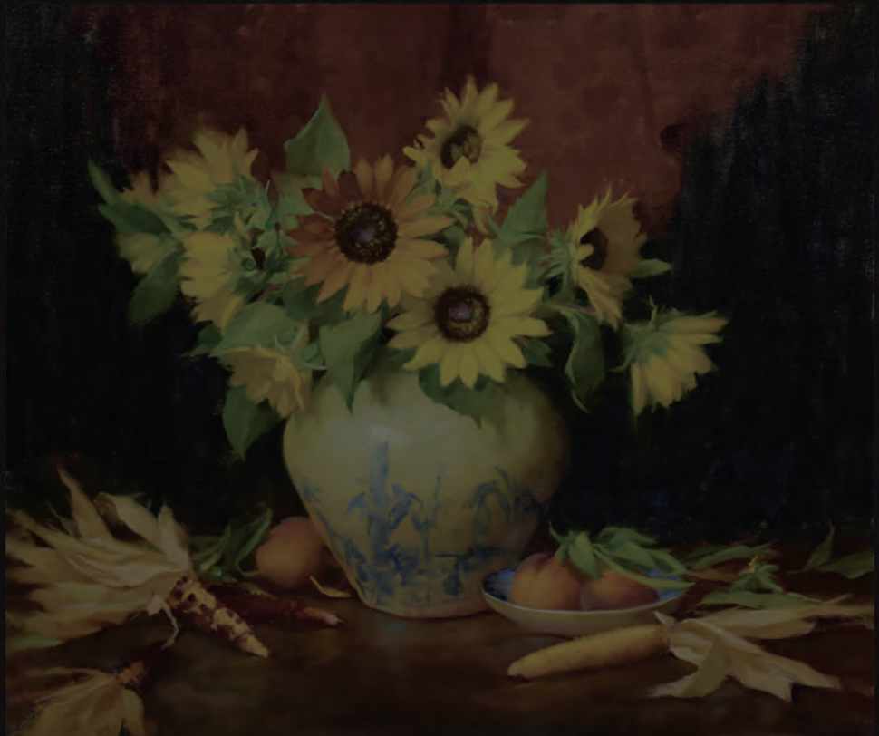
ELIZABETH ROBBINS (b. 1962) Indian Summer , 2017 Oil on linen, 24 x 28 in. Private collection